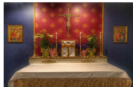
Holy Name of Mary, St. Jerome, Our Lady Help of Christians