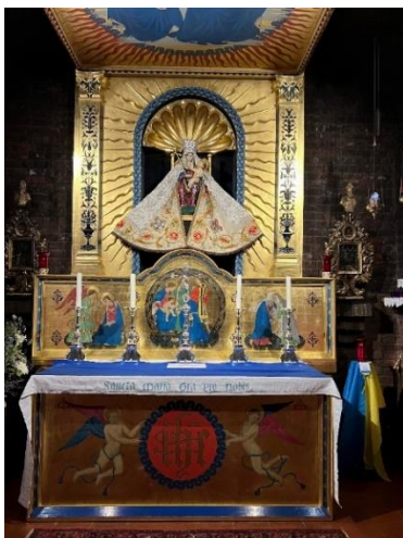
(Pictured are the Roman Catholic and Anglican Shrines)