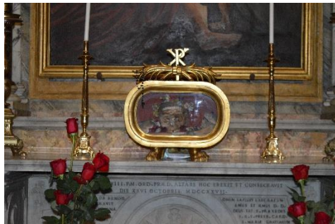
The Skull of St. Valentine

While the Church Militant often causes injury to the Church (in all of its lungs) because of lack of welcome, the many sins of its clergy, and sometimes sheer ineptitude, I am grateful to serve with you at trying to rekindle people's faith through mercy and charity in our own little niche.