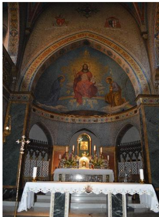
The Church of St. Alphonsus Ligori and the icon of Our Lady of Perpetual Help